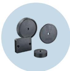
ID-Tags UHF RFID tags with high write and read distances

We reserve the right to make technical alterations without prior notice. · 04.2023 ifm electronic gmbh · Friedrichstr. 1 · 45128 Essen