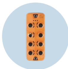
IO-Link master For use in factory automation