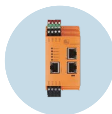
Diagnostic electronics Vibration monitoring of machines and equipment