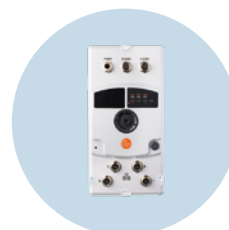
edgeGateway field applications Secure data transmission from harsh industrial environments