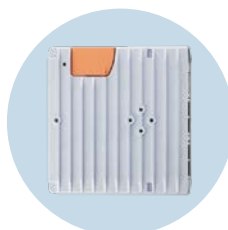
edgeGateway For secure transmission of system data to the IT level