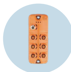
IO-Link M12 modules Connection of binary sensors to IO-Link masters