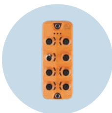
IO-Link master For use in factory automation

We reserve the right to make technical alterations without prior notice. · 04.2023 ifm electronic gmbh · Friedrichstr. 1 · 45128 Essen