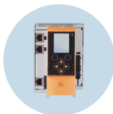
Smart PLC For data exchange with the sensor actuator level