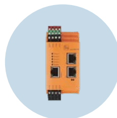
Diagnostic electronics Vibration monitoring of machines and equipment