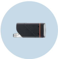
O2D5 2D vision sensor For the analysis of surfaces and contours

We reserve the right to make technical alterations without prior notice. - 04.2025 ifm electronic gmbh · Friedrichstr. 1 · 45128 Essen