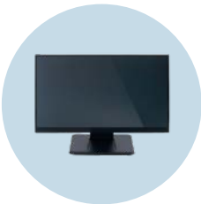
Monitor with touch panel For display and operation of ifm mate