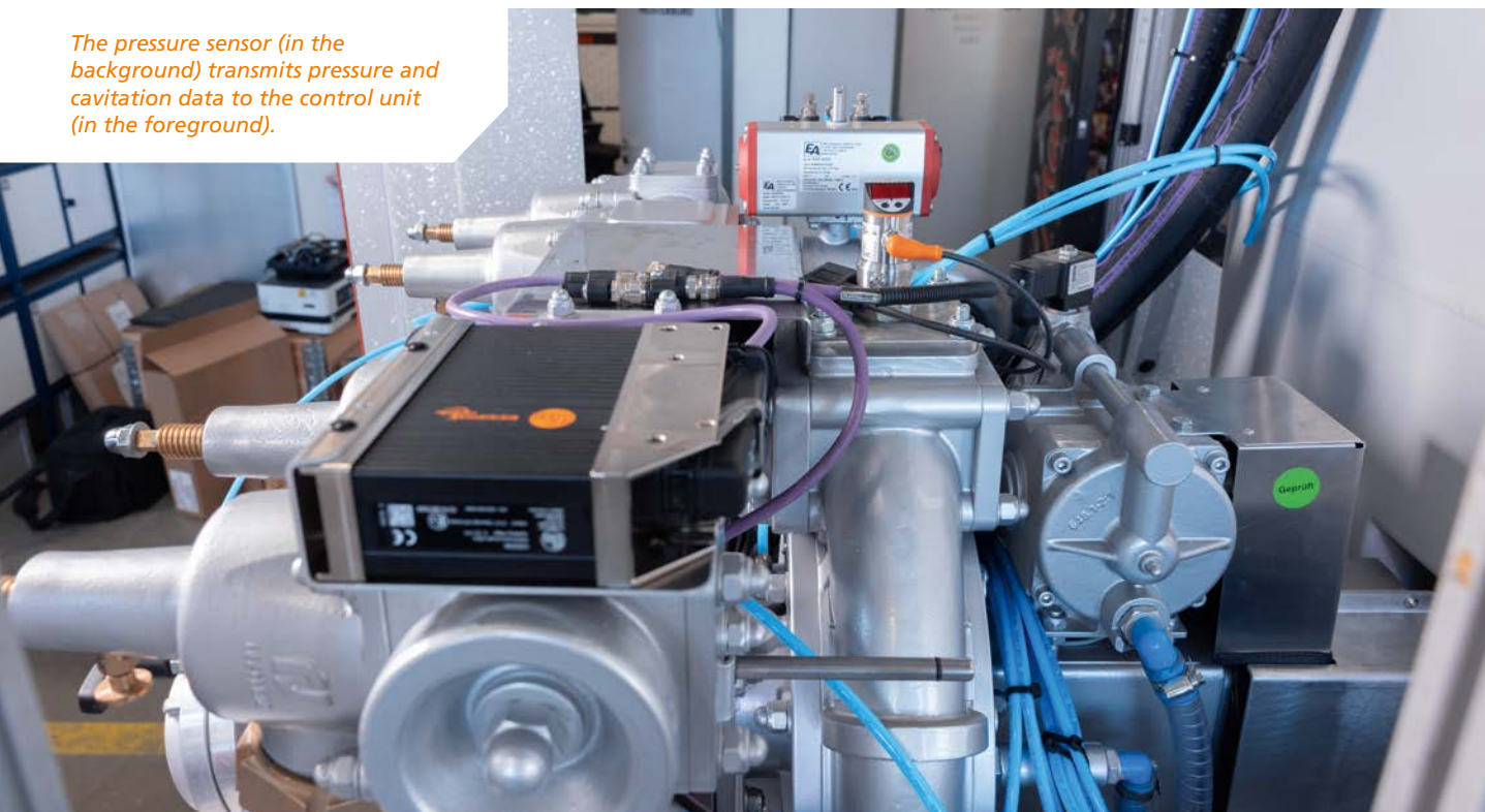
The pressure sensor (in the background) transmits pressure and cavitation data to the control unit (in the foreground).

The driver engineer uses the Human Machine Interface (HMI), a robust type-CR1081 7-inch control display, to access the relevant information and control the pump and other vehicle functions. It is no coincidence that this is not done via touchscreen, but by means of six buttons and a rocker switch.