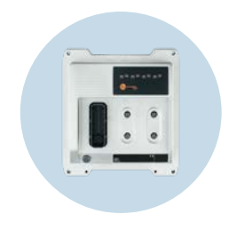
ecomatController Powerful 32-bit controllers reliably control AGVs