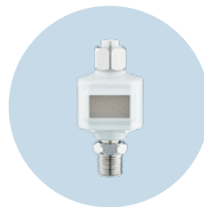
IO-Link converter Analogue converter especially for the food industry