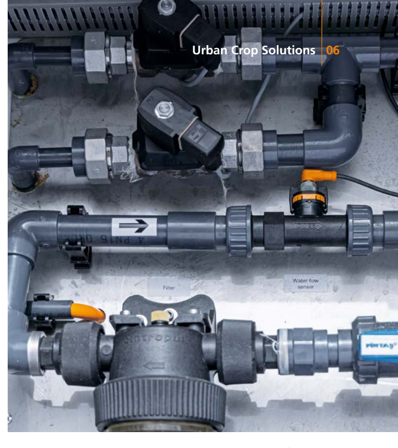
Fill level, temperature, and flow rate – three factors that determine the quality of the plants – are monitored by ifm sensors.

With reliability and quality, ifm sensors contribute to efficient, economical indoor farming solutions. They show their strengths in sustainable local supply, but in the future, they could also take on an important role in growing seedlings for traditional outdoor farming – and thus also in ensuring nutrition for the global population.