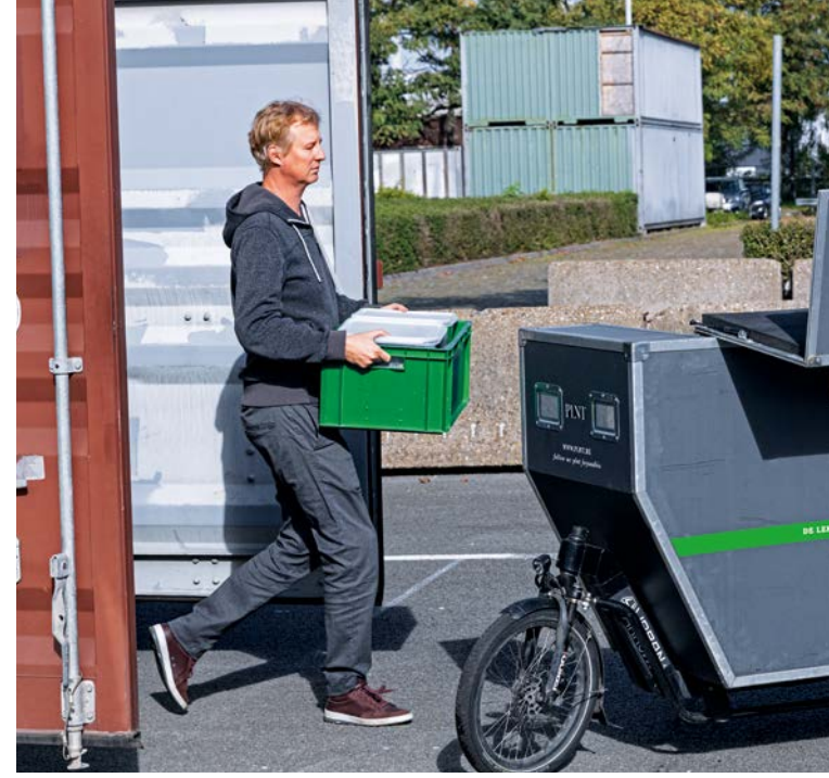
Sustainability as the overall concept: Antwerp company PLNT produces in worn-out sea containers, always only in quantities that are covered by local demand.

We made a very conscious decision in choosing ifm as our partner for the sensor system. The sensors have proven themselves in intensive tests and as of today we have never experienced a failure.