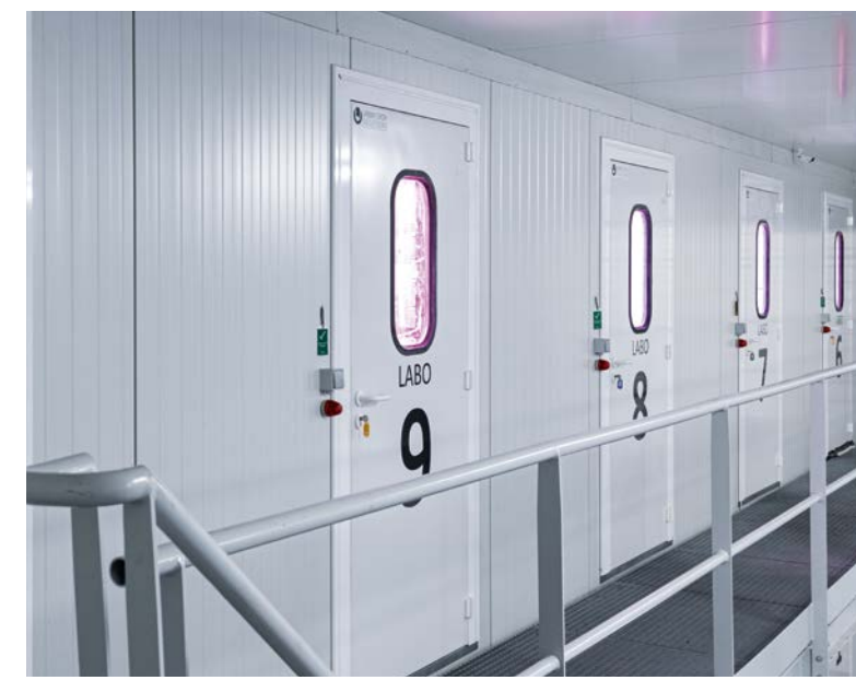
Urban Crop Solutions conducts plant research for the present and the future in its own laboratories.

"Plants can be grown with water consumption equivalent to five percent of the water consumed when growing plants conventionally. Plants can also be produced close to the end consumer, thereby further reducing stress on the environment. Finally, indoor farming can also be done without using pesticides, which increases the nutritional value of the product considerably", says Vandecruys.