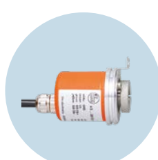
Multiturn encoders Precise detection of positions and rotational movement