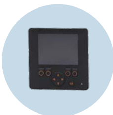
Graphic display Programmable HMI for the control of mobile machines

We reserve the right to make technical alterations without prior notice. · 09.2023 ifm electronic gmbh · Friedrichstr. 1 · 45128 Essen