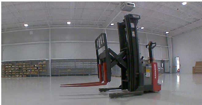
The robotics platform captures the situation in a 2D image and in 3D distance data.

Autonomous transport systems have to overcome two major challenges: on the one hand, collision avoidance with objects and persons, on the other hand, autonomous avoidance of obstacles. The frequently used safety scanners are only of limited help here, as they only detect the travel path in a plane just above the ground. This is where the camera platform shows its advantage: it processes the signals from up to six 3D PMD cameras installed all around the vehicle and evaluates the environment three-dimensionally, i.e. both the ground area below the field of view of the safety scanners (e.g. holes in the ground) and the view diagonally upwards. In this way, hanging loads such as crane hooks, for example, are also detected. Powerful algorithms ensure that false detections are virtually eliminated despite the high detection rate.