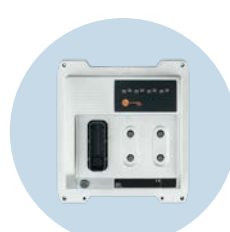
ecomatController Powerful 32-bit controllers reliably control AGVs