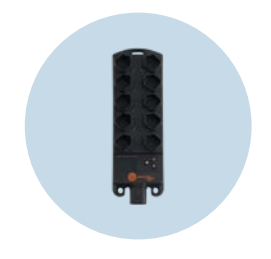
ioControl Decentralised connection of sensors, freely programmable